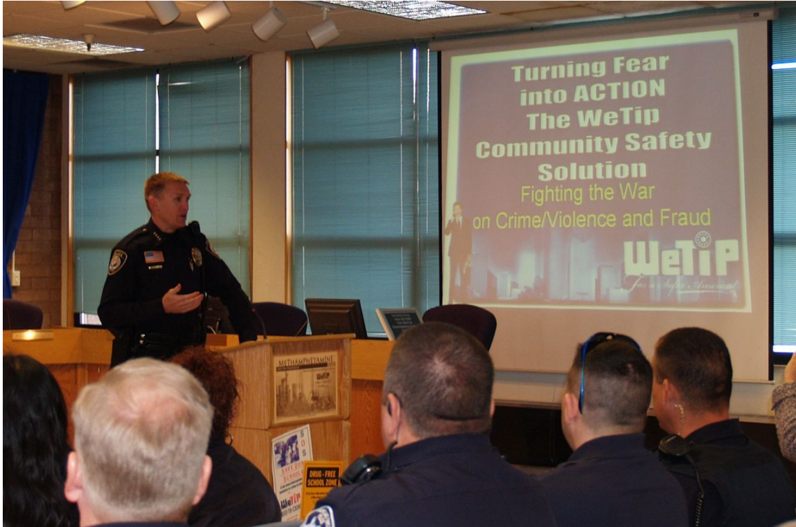
Top photo: Navajo County Sheriff KC Clark